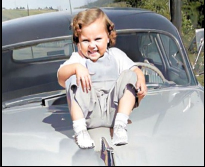
Guess who? Send us your childhood pho- tos so we can enjoy and guess who.