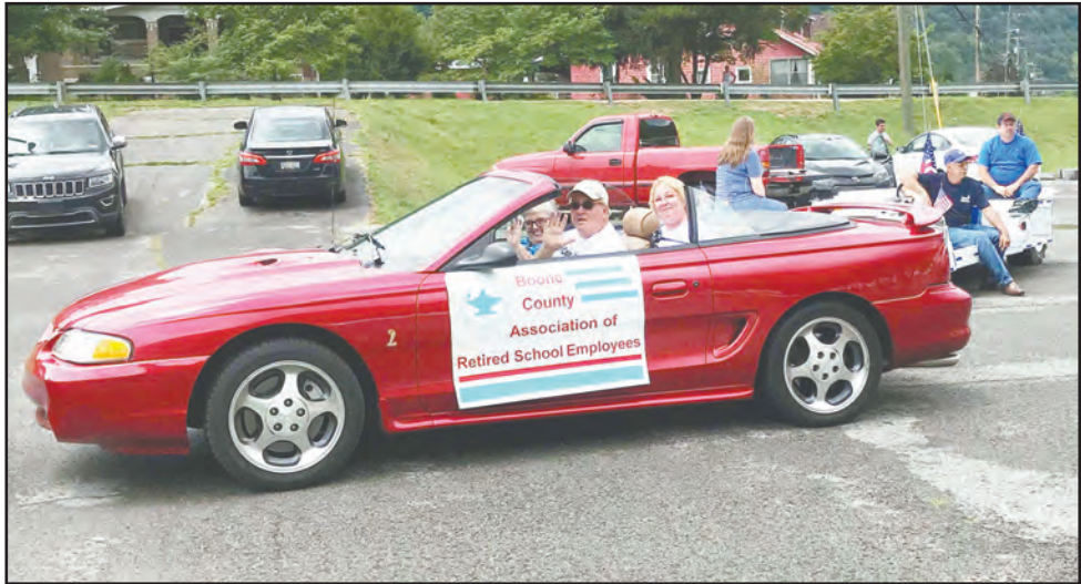
Representing BCARSE at the 25th Coal Festival Parade.