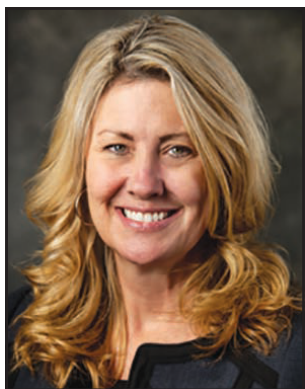
Erikka Storch (R - Ohio, 03)