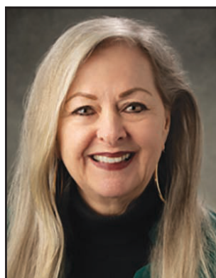
Sue Cline (R - Wyoming, 09)