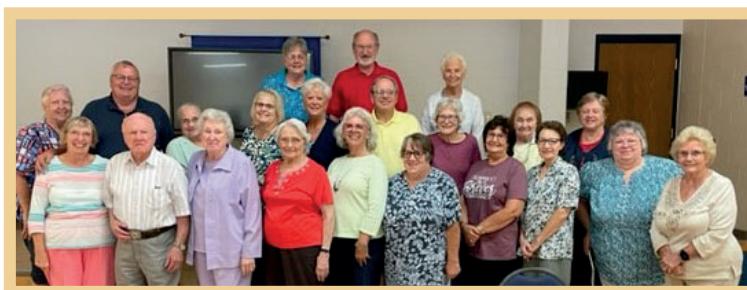
Taylor County Retired School Employees