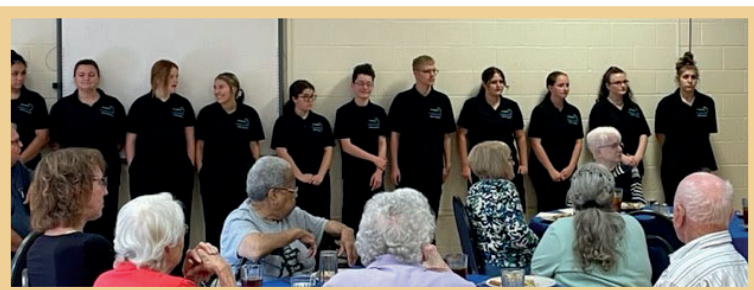
Some of the students that prepared & served

The Taylor County Career Center prepared and served a very good and very formal meal.